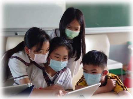
Using Digital Device to Gain Extended Knowledge

Digital Deep Cultivation Program · PBL THSD Program , 5G Program Technology learning : AI IoT AIoT AR VR MR XR / SDGs Whiteboards, Notebooks Authentic Assessment